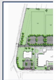
SKHS – Site plan

But, my biggest beef is with the meeting notices, because if someone wants to watch the meeting they have to click on the "Agenda" link and have PDF viewing software on their device to get to the LIVESTREAM link!