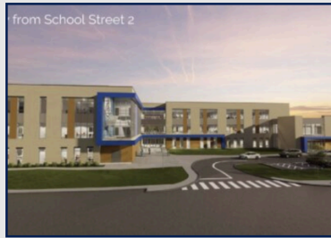
View from School Street 2