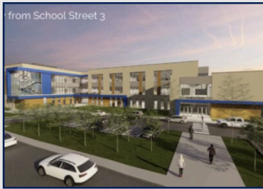
View From School Street 3