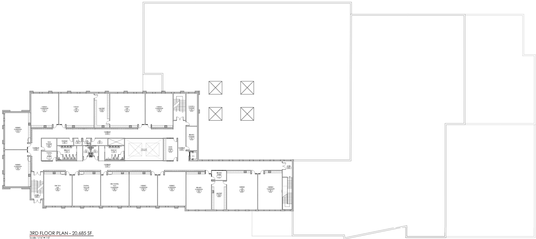
3RD FLOOR PLAN - 20,685 SF Scale: 1/8" = 1'-0"